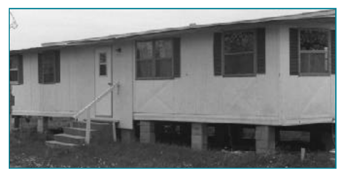
LIMITED HOUSING -- Michigan farmworkers have limited access to a variety of housing. Government regulations now require that farmworker housing have a minimum amount of square footage per occupant, running water, and indoor plumbing — things many Amer icans take for granted today.

tions of immigration status affect all their decisions from selection of jobs to length of stay in the community.