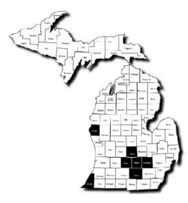
STUDY AREAS -- The Michigan Counties included in the recent JSRI research study included Oceana, Berrien, Eaton, Ingham, Livingston, Jack - son, and Clinton.

This study is limited in scope in that it cannot be used to generalize the entire state. However, the sample covers Oceana and Berrien Counties, and the 5-county Lansing area. Together they constitute about one-eighth of the